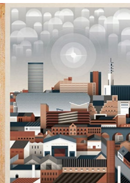
'Brum Cityscape II' by Alex Edwards