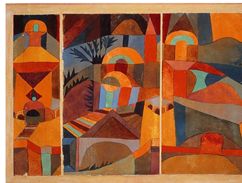
'Temple Gardens' by Paul Klee